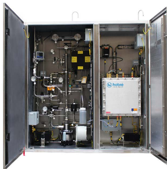
Figure 1. H 2 S in Liquid Sampling System

The sample is taken directly from the fast loop, with identical sample characteristics to those of the process.